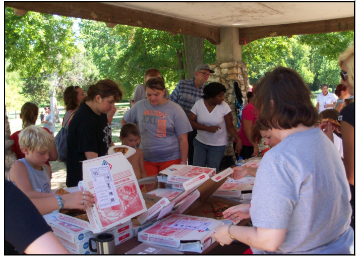
Above: Students and families gather around pizza during the August Destined for College meeting.